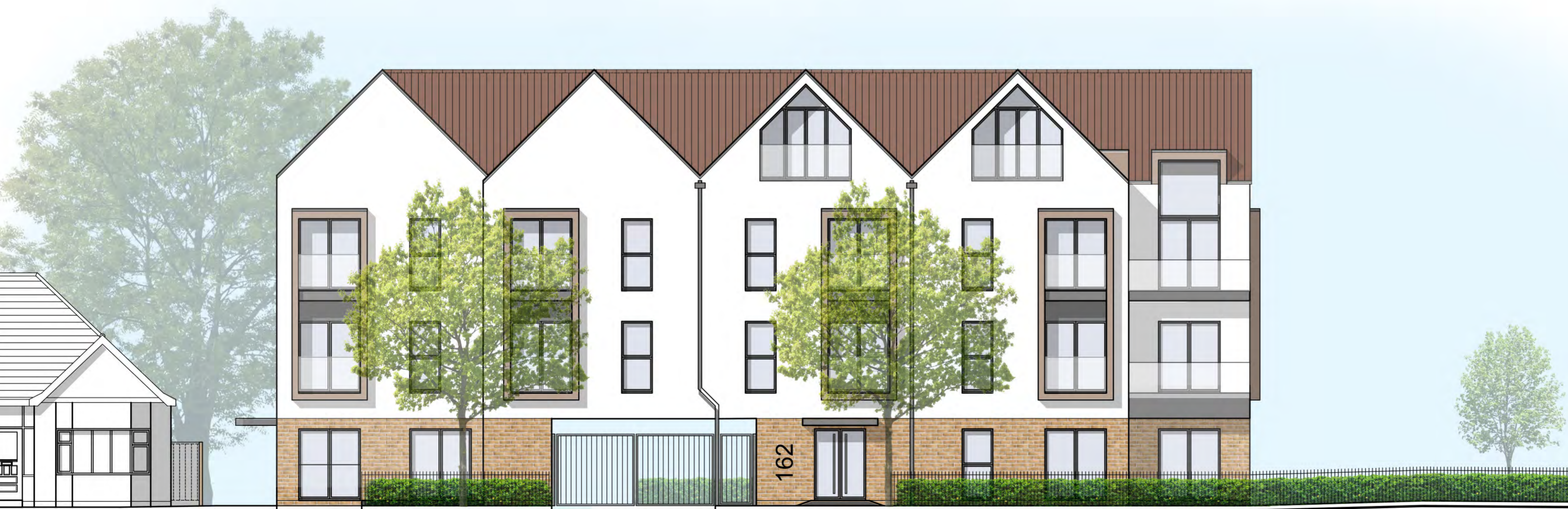
STREET-SCENE AA (Along Blenheim Chase).